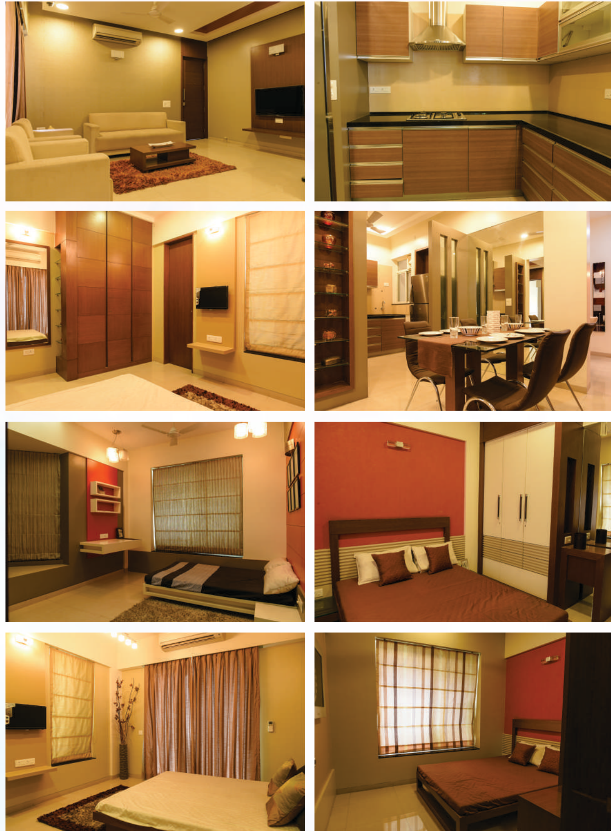
Sample flat actual photograph...