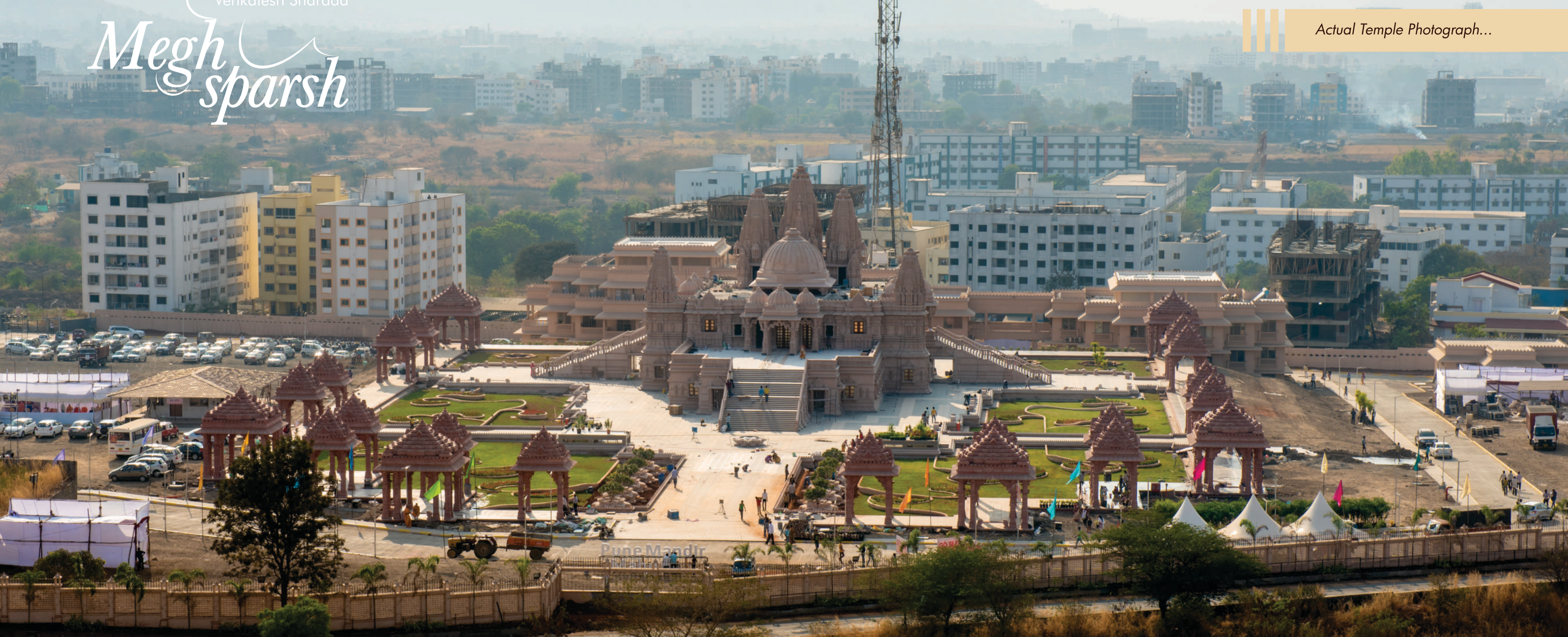
SWAMINARAYAN TEMPLE VIEW FOR LIFETIME...